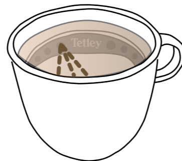
2. Fill hot water past ring to release tea concentrate