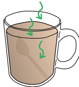
3. Brew one minute