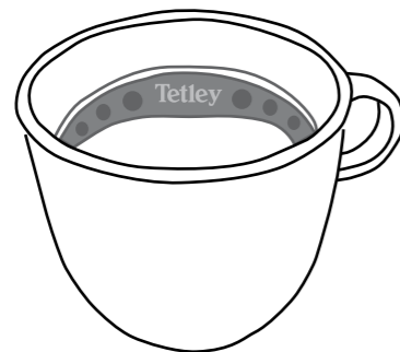
1. Fit ring in cup